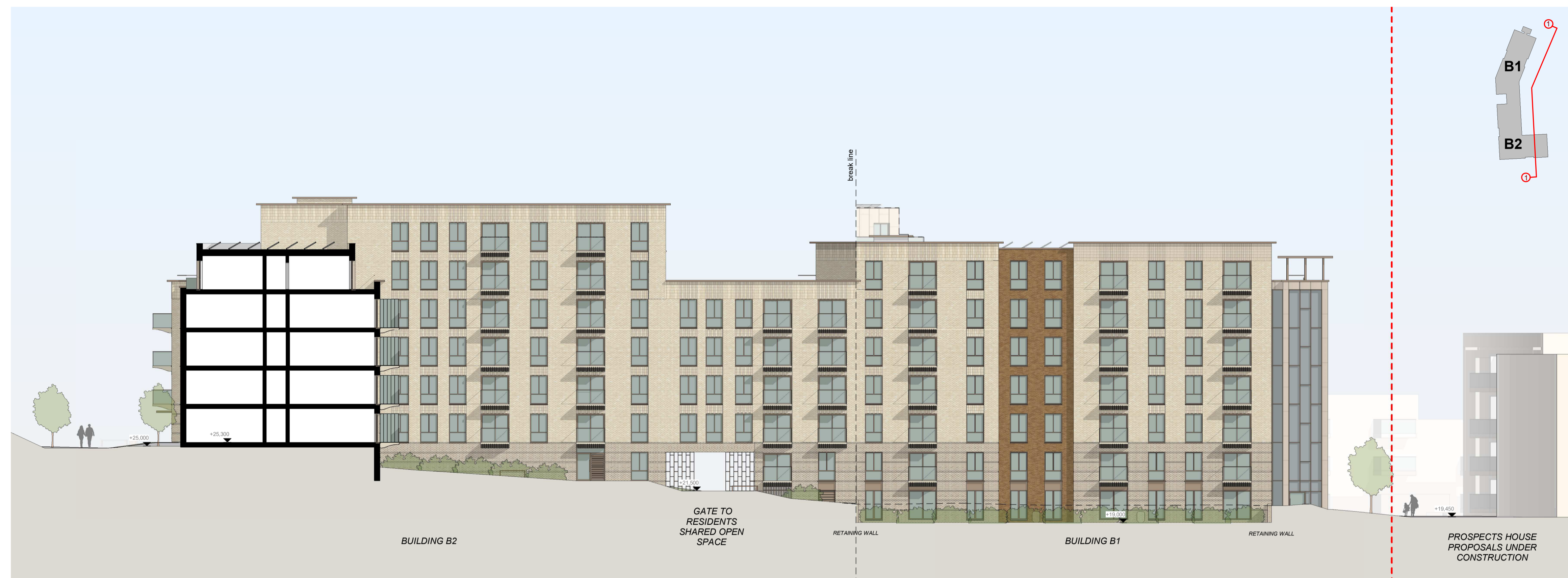
1 East Elevation (Flattened) 1 : 200