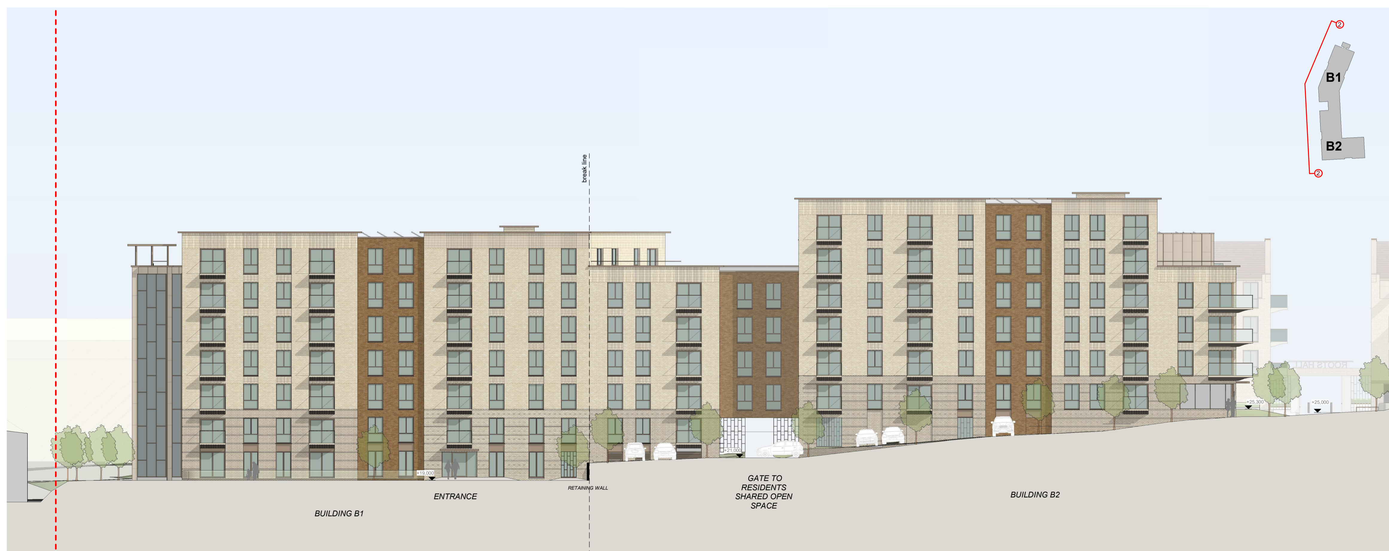
2 West Elevation (Flattened) 1 : 200